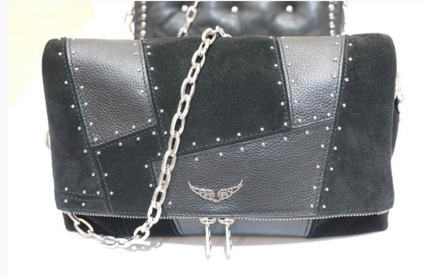
ZADIG & VOLTAIRE