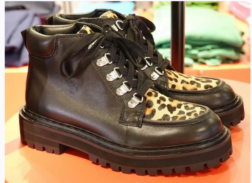
MAX & CO