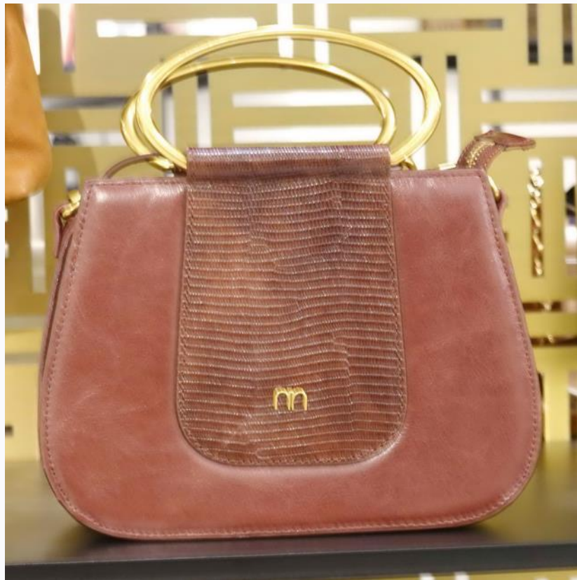
NAT & NIN