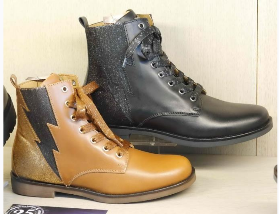
STONES AND BONES