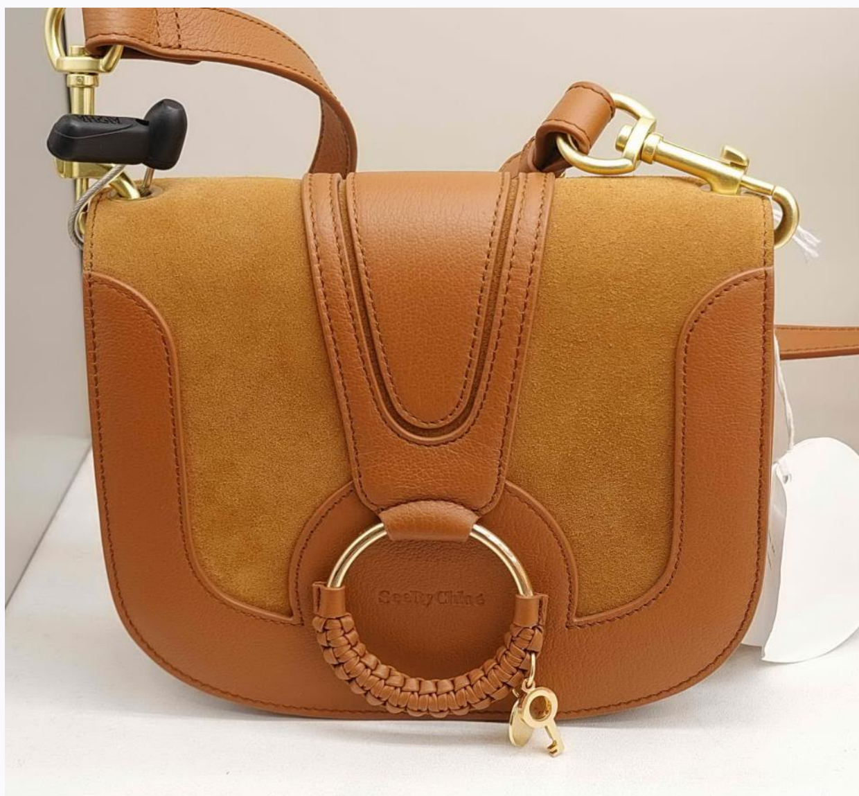
SEE BY CHLOE'