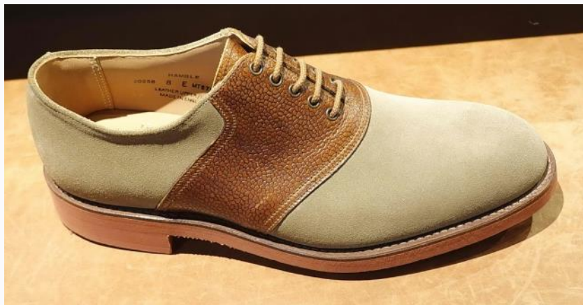
CROCKETT & JONES