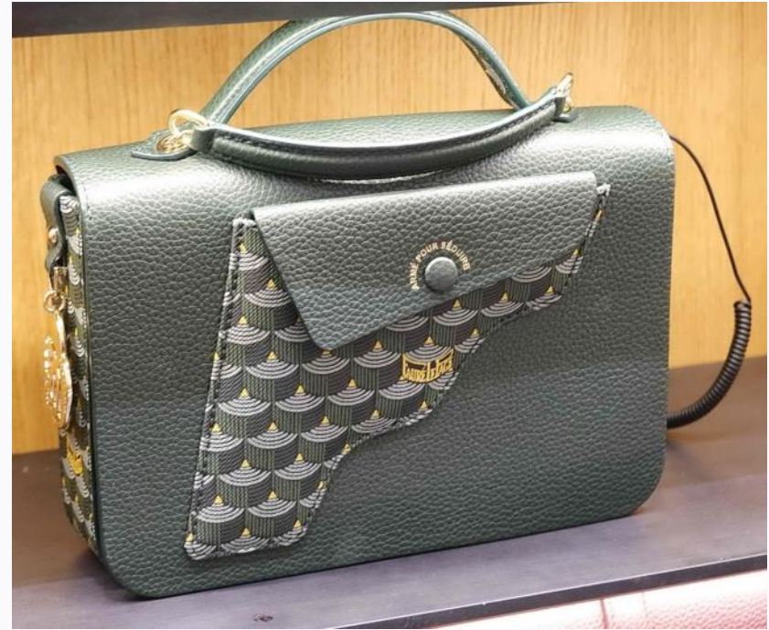
FAURE LE PAGE