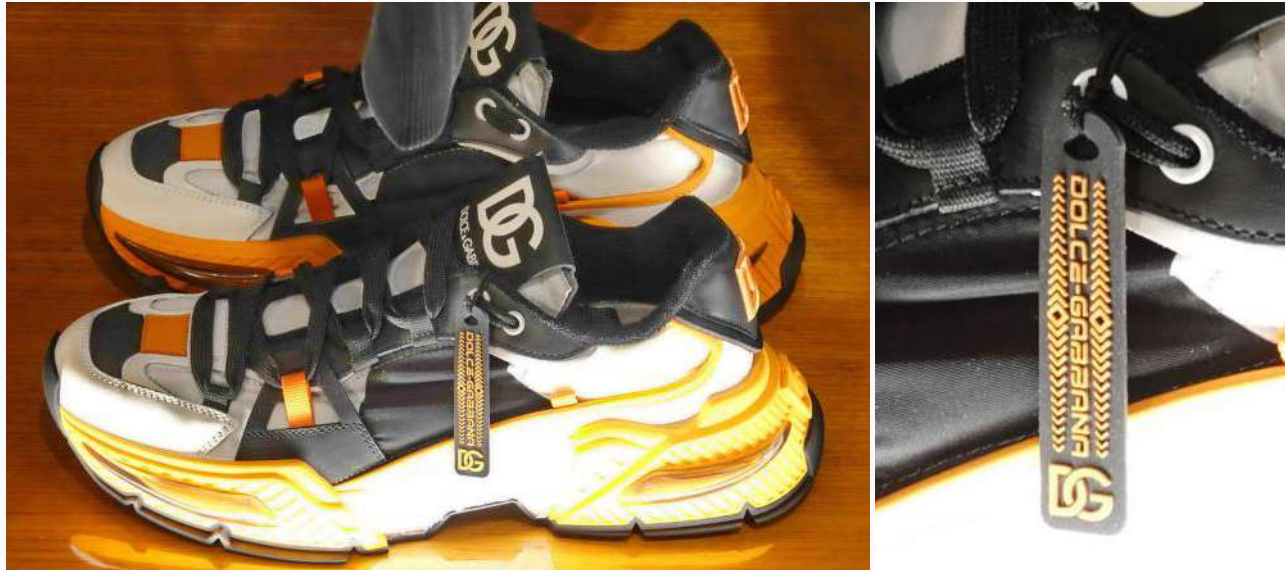
DOLCE & GABBANA