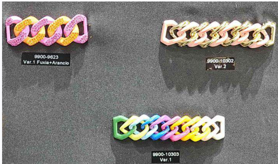
EM COMPANY SRL