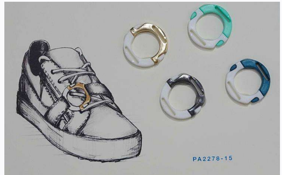
GAMAR ITALIA SRL