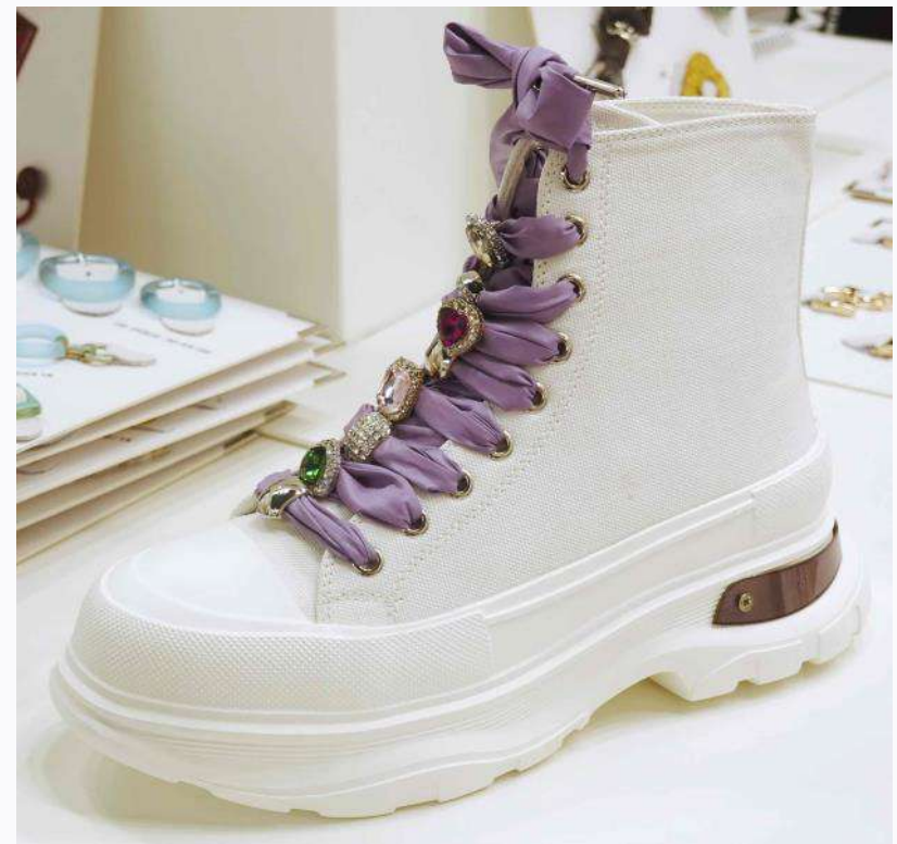
MODA TEC SAS