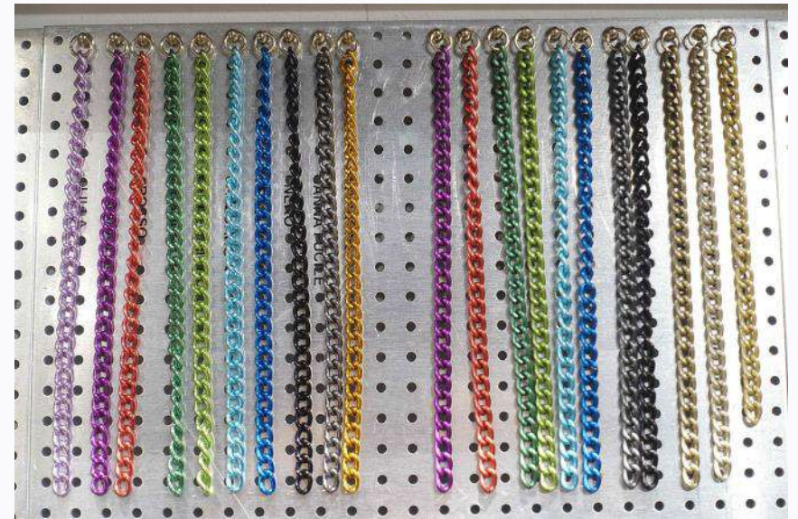
ABC CARUSO GROUP SRL