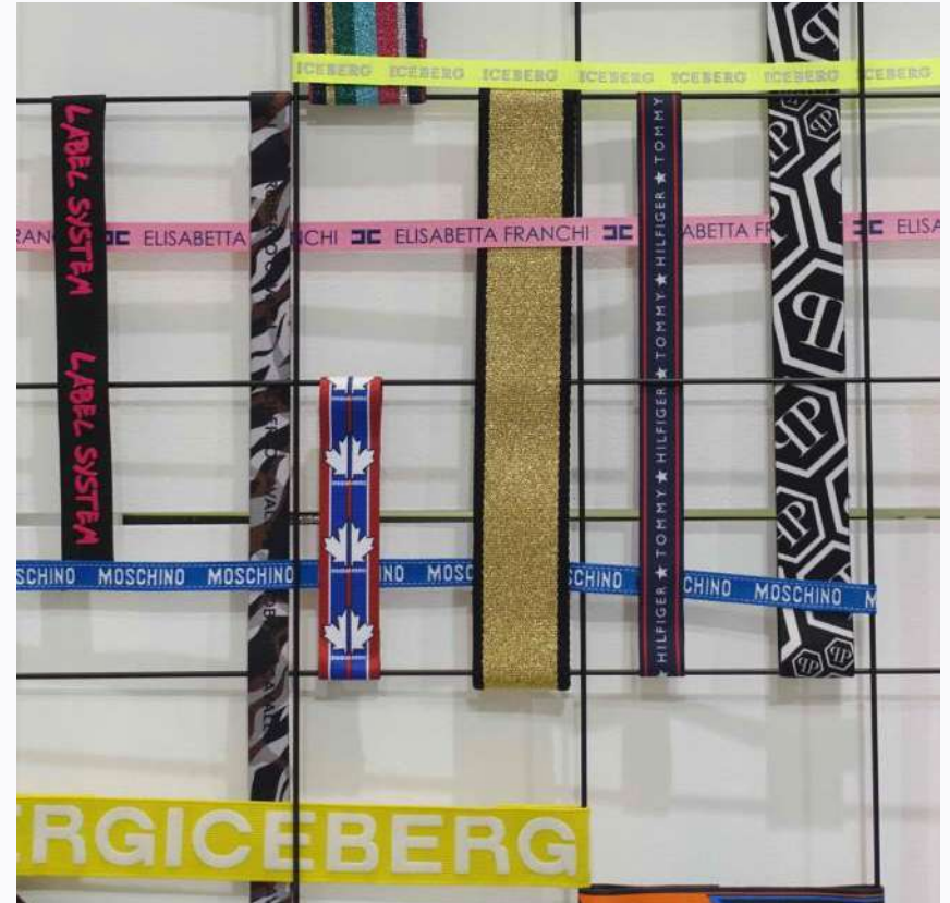
LABEL SYSTEM SRL