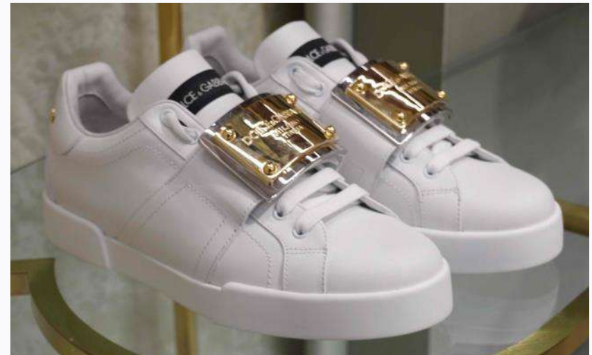
DOLCE & GABBANA