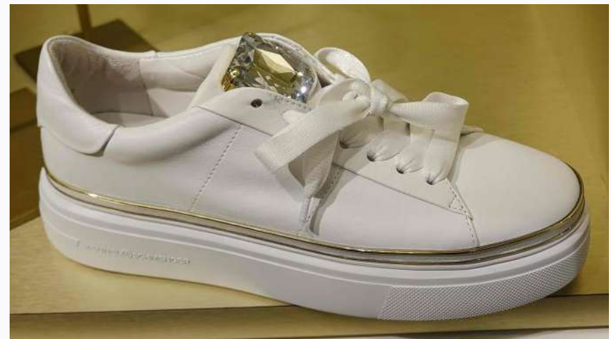
KENNEL & SCHMENGER