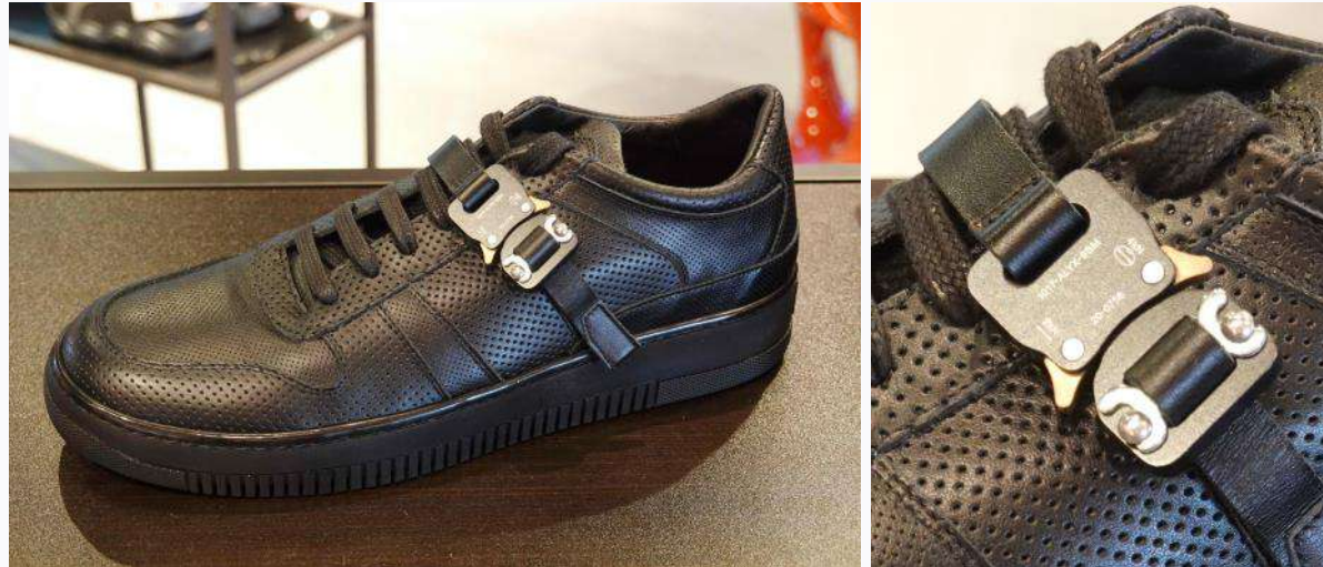
1017 ALYX 9SM