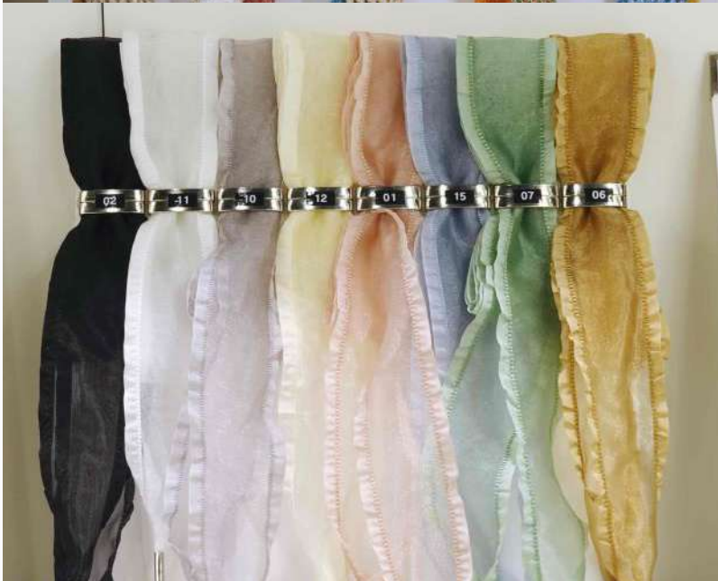
MODA TEC SAS