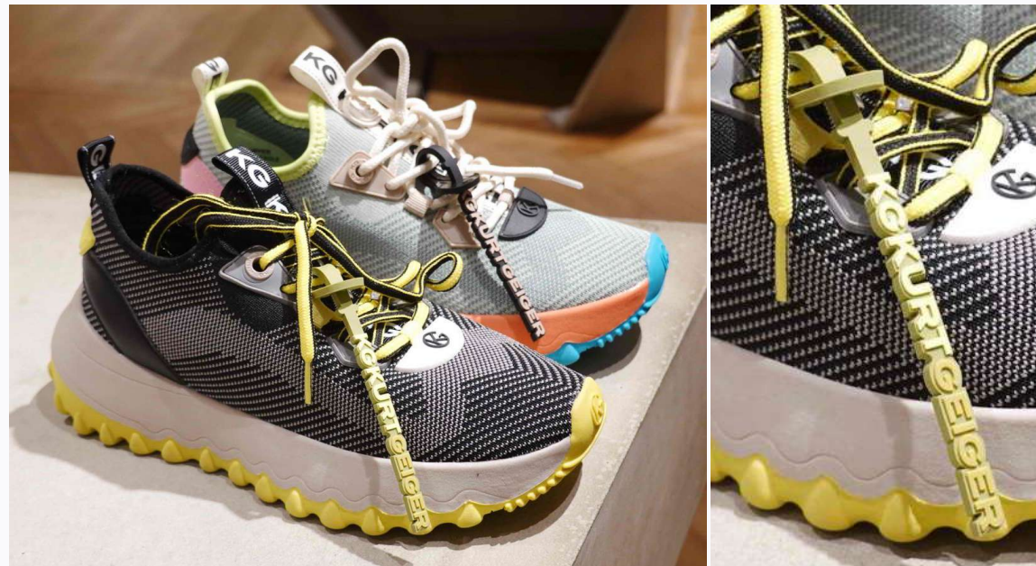
KG BY KURT GEIGER