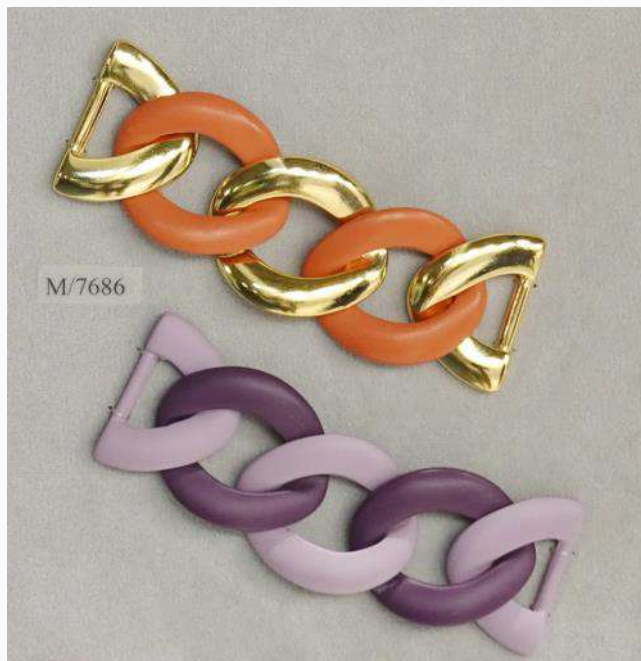
ACCESSORI METALLICI 4 X 4 SRL