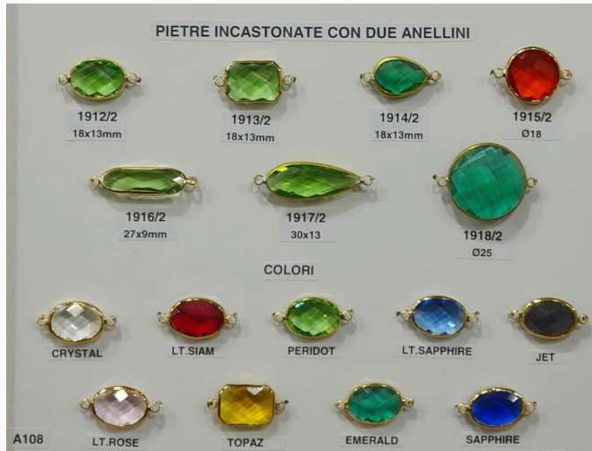
GI MA SRL