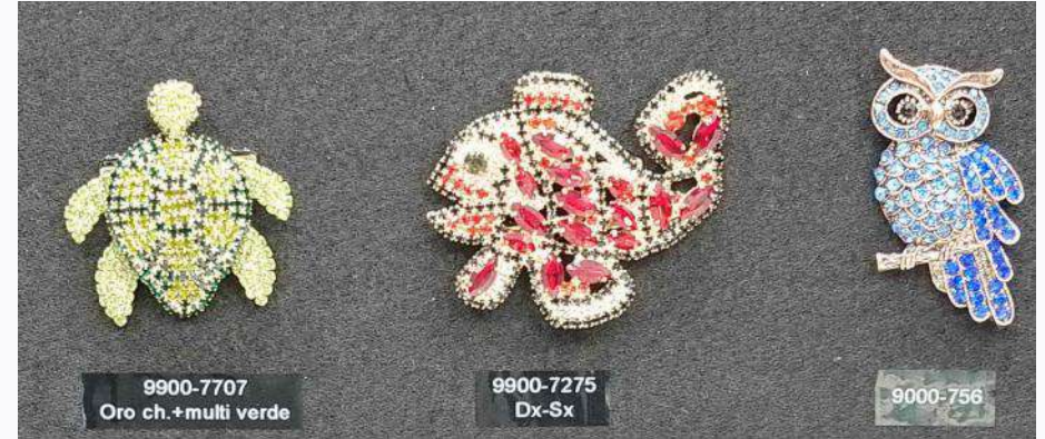
EM COMPANY SRL