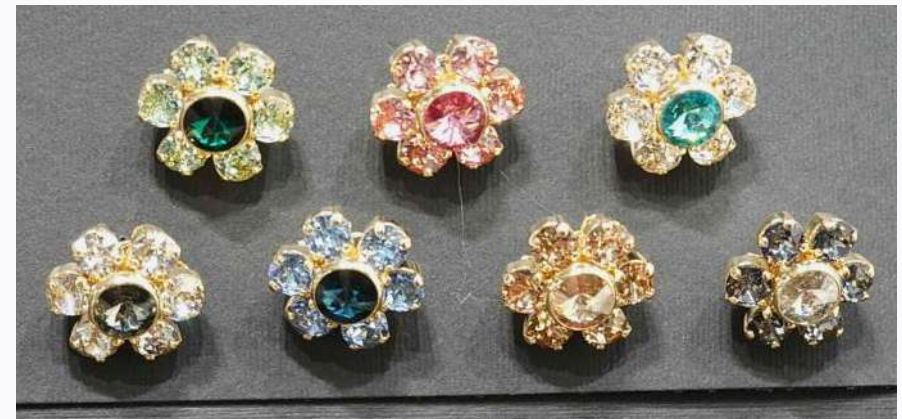
FASHION HARDWARE SRL